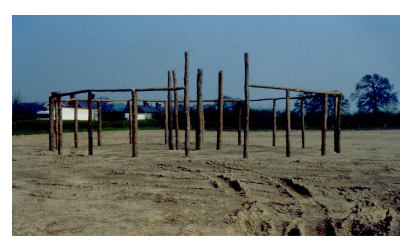
Sarn-y-bryn-caled, Powys, as reconstructed at the end of the excavations