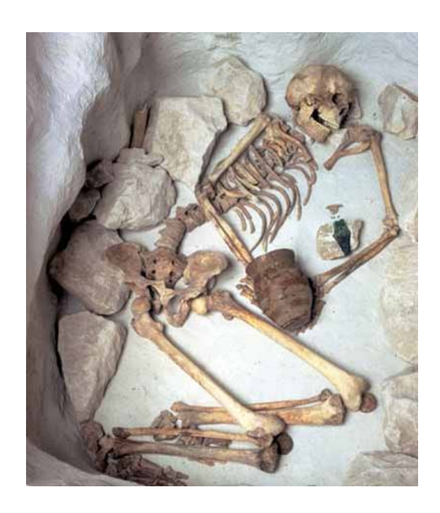
Beaker burial from Shrewton, Wilts. (Courtesy of Salisbury Museum).

Barrow building reached its peak around 1700/1600 cal BC. From this period there is a marked decline in the construction of new sites, and those that are built tend to be smaller and associated with cremations buried inside urns. This shift is marked by the use of Deverel Rimbury ceramics and the widespread appearance of fields and roundhouses, which characterize the Middle Bronze Age.